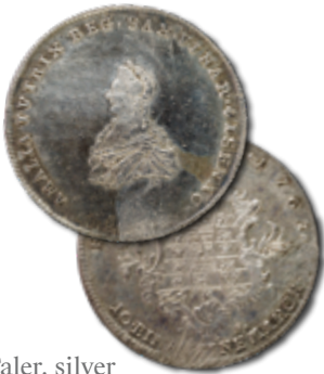
1 Taler, silver