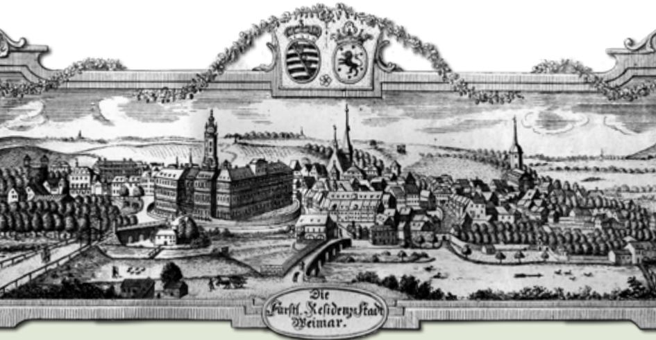
View of the city of Weimar