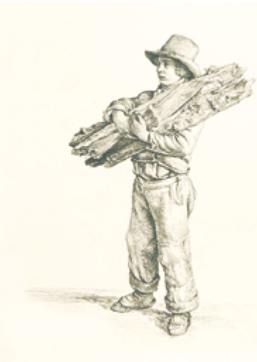
Peasant boy with firewood

TRIFT/TRIFTEN = the sheep of the landlord had the first right to be herded over the property of the peasants