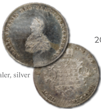
1 Taler, silver