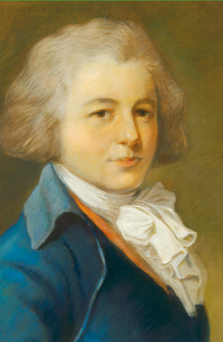
Friedrich Justin Bertuch (1747-1822)