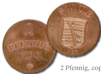
2 Pfennig, copper

*Pfennig = penny; Groschen = groat; Taler is an old German (Austrian and Swiss) silver coin; Carolin is a more valuable coin.