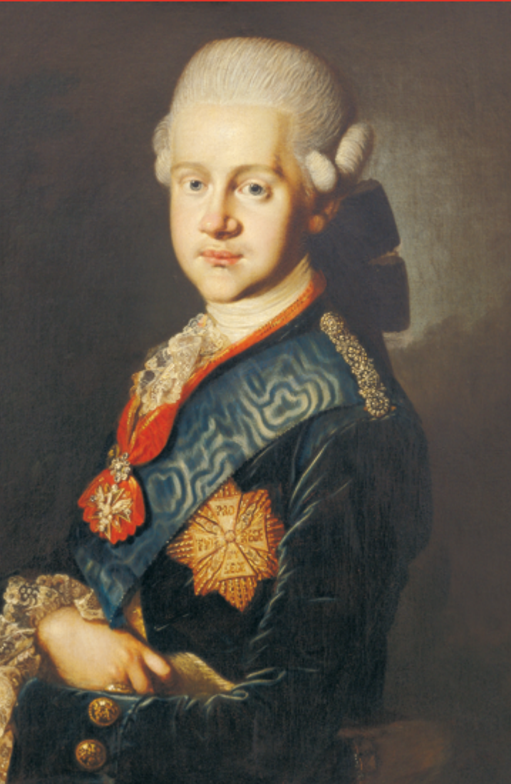
Herzog Carl August (1757-1828) Duke Carl August