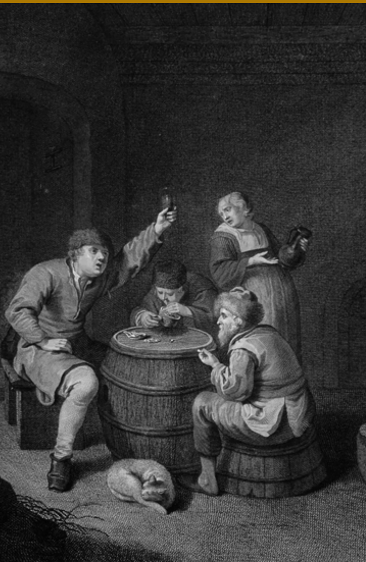
Bauern bei einem Fasse Peasants at a barrel