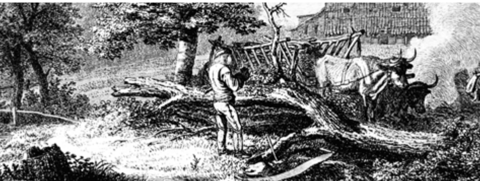
Woodcutter near the cow wagon