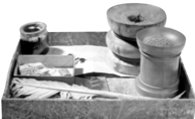
Inkwell with quill

“The schoolmaster could hardly live from teaching“