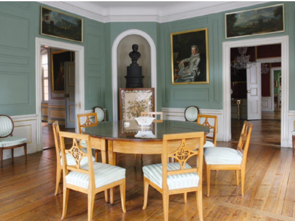
Round table room in the Wittumspalais