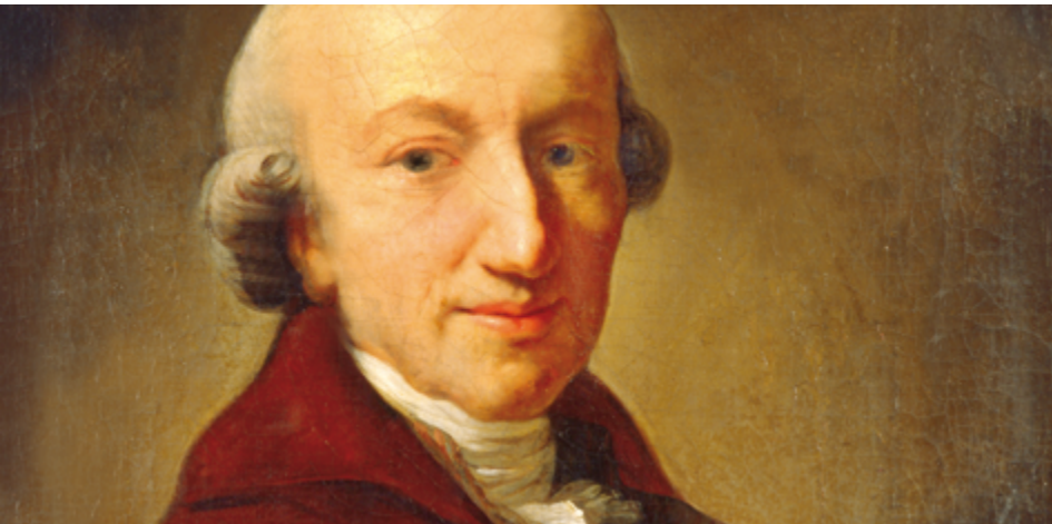
Christoph Martin Wieland