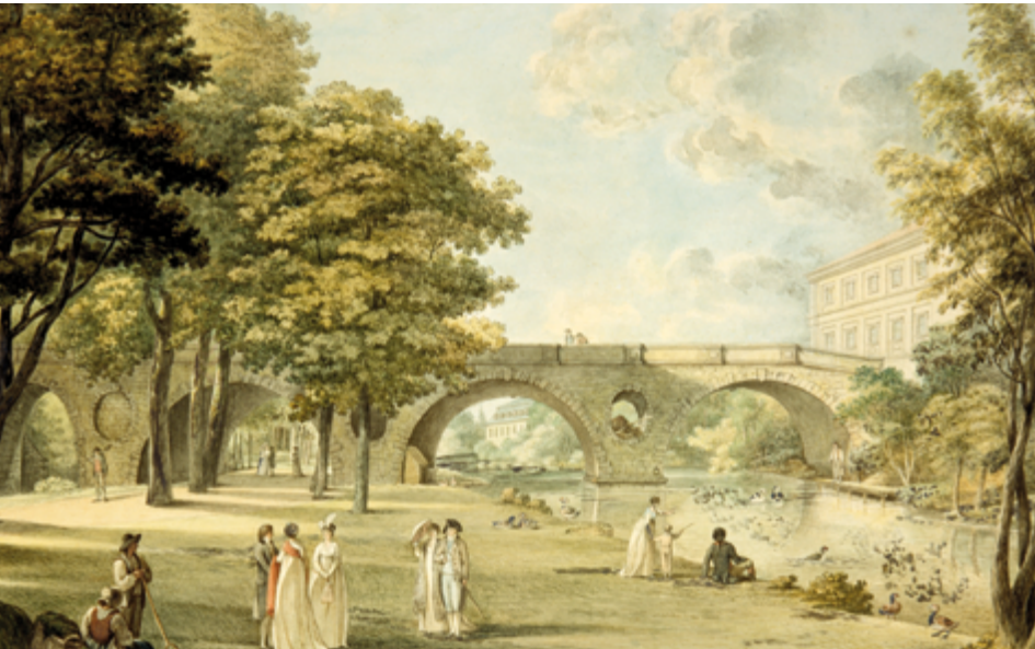
Sternbrücke (Star Bridge) and palace facade in the Weimar Park